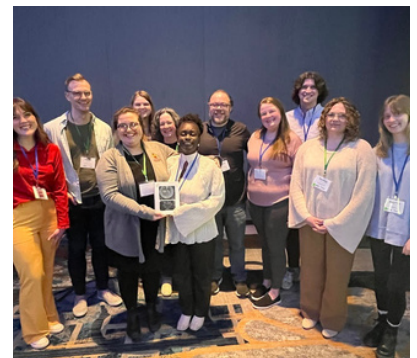
Iowa State University John E. Moore Award