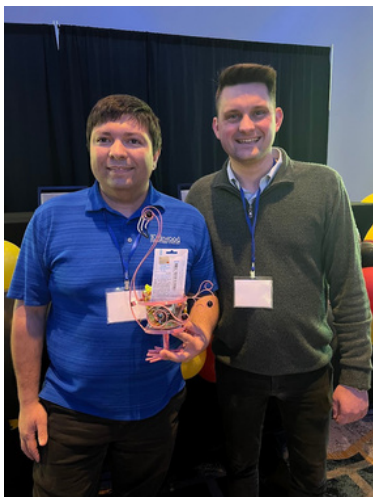
Kirkwood Community College Fabulous Frieda Award