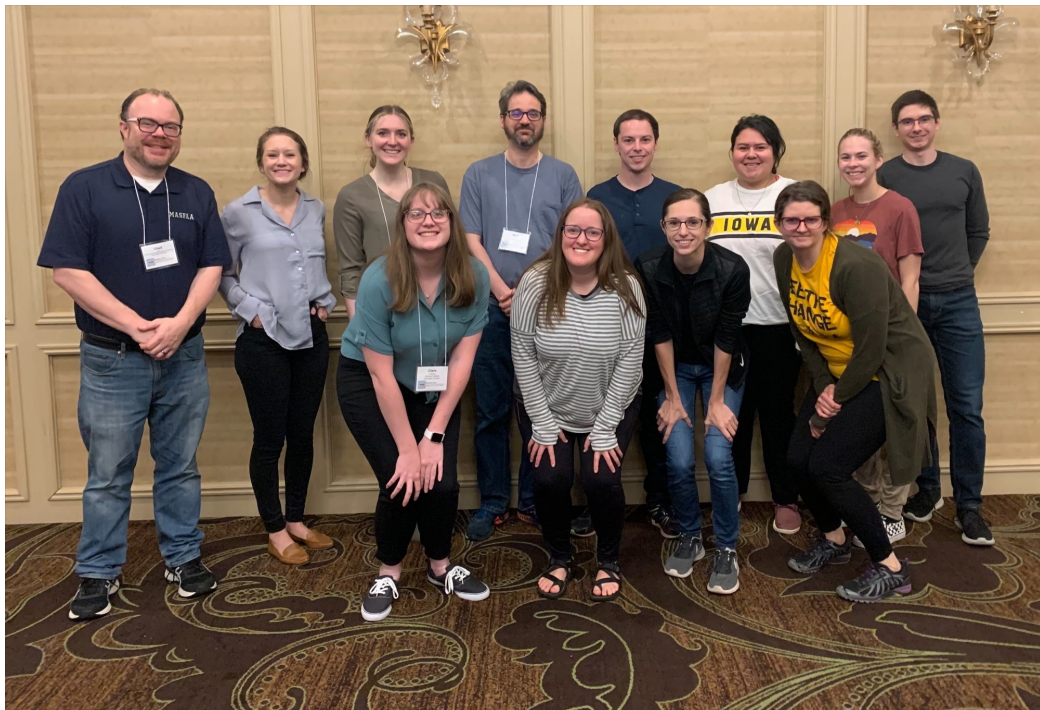
IASFAA members at the MASFAA Summer Institute and Leadership Symposium