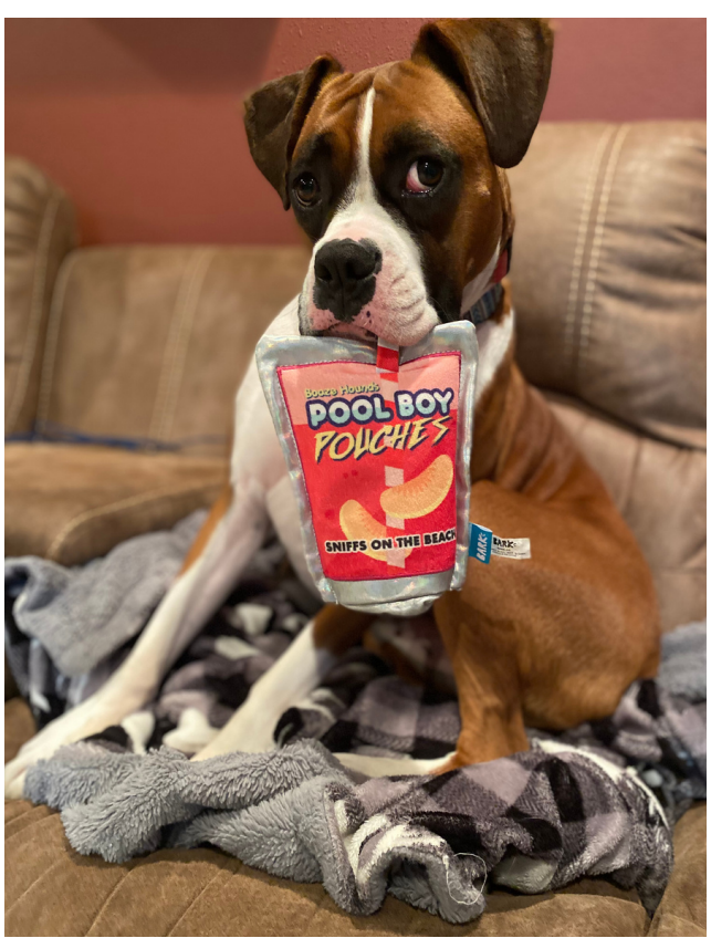
Rachel Moser 19 month old boxer Ziva. Ziva is quite the character and excels at cuddling